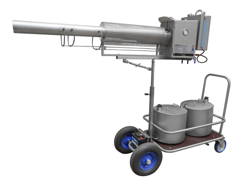
Pulsfog K40 is being produced by Veugen Technology BV under license held by Dr. Stahl & Sohn GmbH - Pulsfog. Depending on the options on your fogger, your product may look different from the image.

The Pulsfog K4O is also suitable for disinfecting poultry houses and greenhouses. The Bio system (water-cooled) with separate fluid lines also makes it possible to spray biological agents without affecting the crop protection agent.