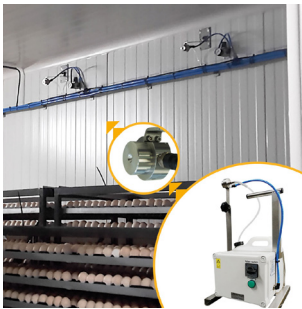
HALOFOG 300 Hatch