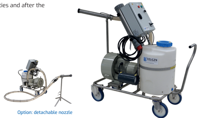
Option: detachable nozzle

The Powerfog P60 is now also available with removable spray head (can also be placed on stand) and with extended hose. This makes the unit even easier to position outside the area to be treated.